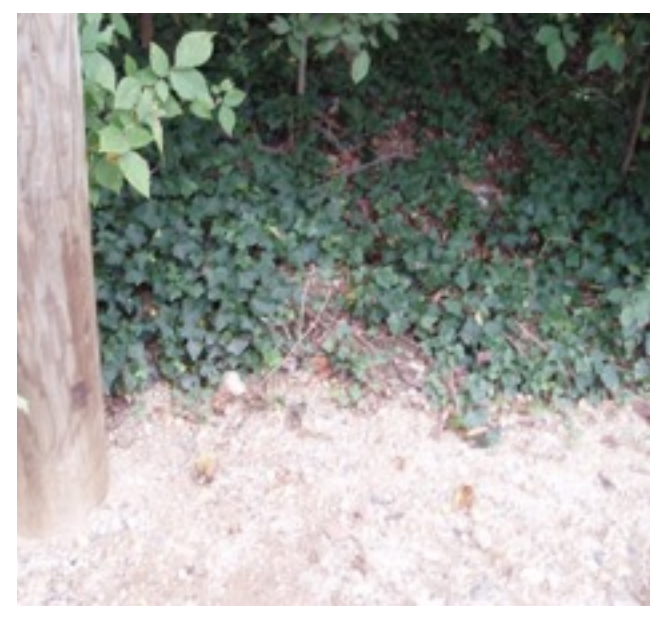
Example of English Ivy on the Ground