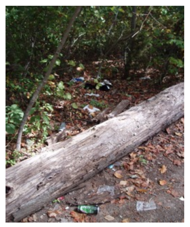
Trash on the Ground in the Park